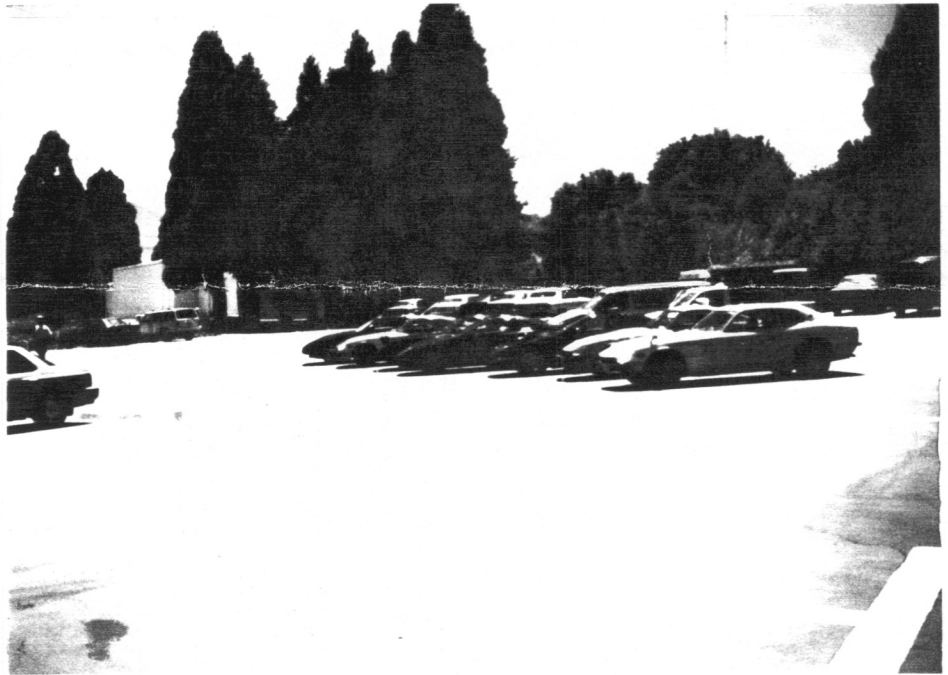
Seven Z's plus the GBV 2+2+3 in the Mt. Palomar Observatory parking lot, the observatory dome is in the left corner.

South Grade road I pulled over to let the poor unfortunate Z behind me (remember, I was driving the GBV and boy was I jealous!) pass to catch the rest of the pack. After everyone else had relaxed at the top and I pulled in, Gary thanked me profusely. Those who had not brought a picnic lunch were able to get sandwiches at the store at the mile high summit and most of the wimmin folk engaged in their favorite pastime at the gift shop. From there it was only 2-3 miles to the world famous Mt. Palomar Observatory, home of the second largest telescope and source of most of the research and discoveries in Astronomy since the 1940's. After lunch at the shady grove next to the parking lot we toured the Observatory